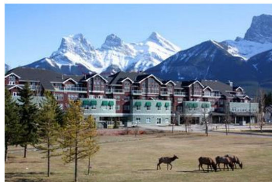
Sunset Resort - Canmore, AB