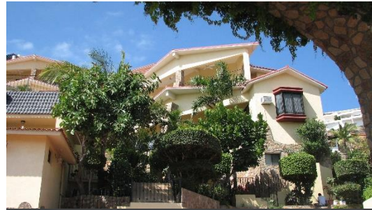
Portofino Resort - Cabo San Lucas

For information about Paradise Resort Club please visit www.paradiseresortclub.com